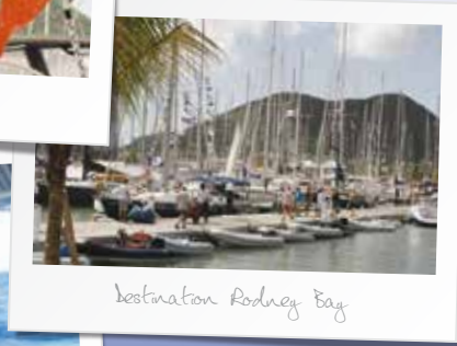
Destination Rodney Bay