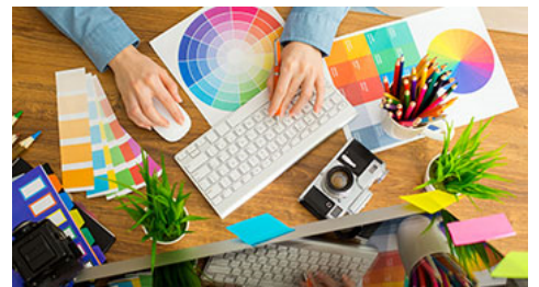
Design & Construct