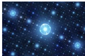
Pharmaceuticals and Chemicals