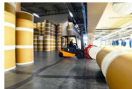
Pulp and Paper